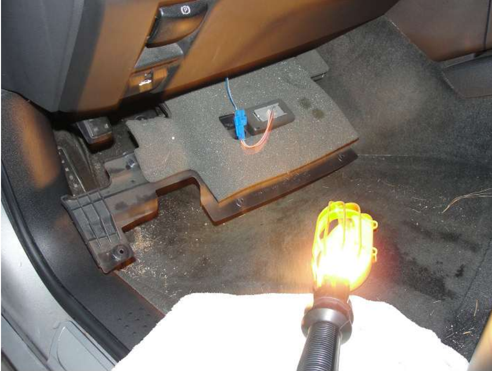
Small pic of the plastic cover off to show where the 4 screws are located